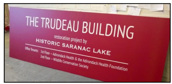
New signage awaits installation on April 30.

Fundraising to meet our goal of $1.7 million has been very successful. We recently received news that the project will be