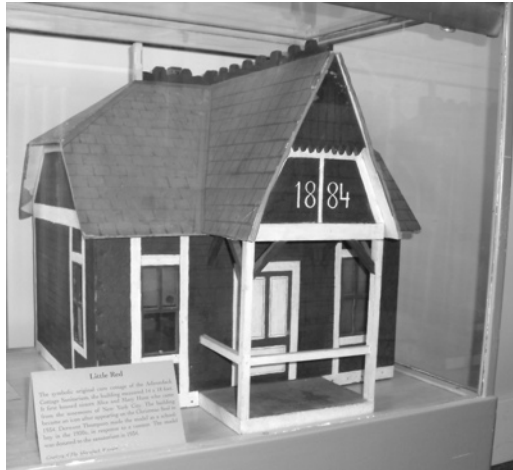
Model of Little Red, built in 1934, now on display courtesy of the Adirondack Museum.

Other changes include a new "cure room" featuring new artifacts such as a model of Little Red on loan from the Adirondack Museum; a new panel on the architecture of the Trudeau Sanatorium,