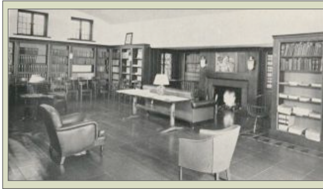
A 1928 photograph of the John Black Room, courtesy of the Adirondack Collection of the Saranac Lake Free Library

“... I knew him in this battle of the porch, Knew his poise, the bright Intrepid smile that like a high-held torch Helped others in the fight....”