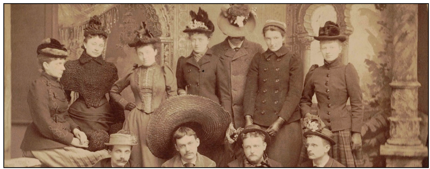
"Bonnet Party" at the Trudeau House (ELT at center back with hat over face).