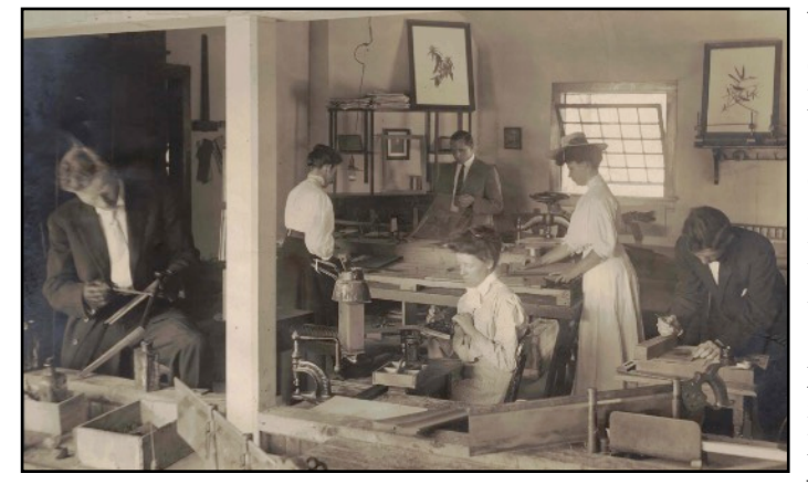
Patients in the Old Workshop, HSL Collection, 2021.4, Courtesy of Trudeau Institute

We are pleased to announce that our online collection database will launch to the public on November 15. Newsletter subscribers get an early sneak peek now! The database, hosted through PastPerfect Online, will allow researchers to search our collection from home. The records include photographs, objects, books, and more. Right now, there are only a handful of records available, but we will continue to add records to the catalog as we complete our IMLS