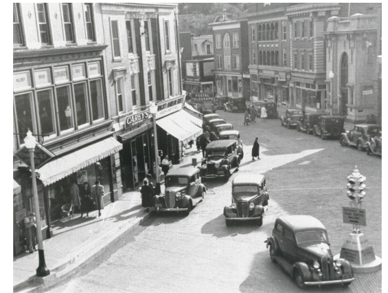
Photo #06.218-O

In 2011, Historic Saranac Lake unveiled a new John Black Room exhibit of historic photographs. The photos, on loan from the Adirondack Room of the Saranac Lake Free Library, will remain on display through 2012.