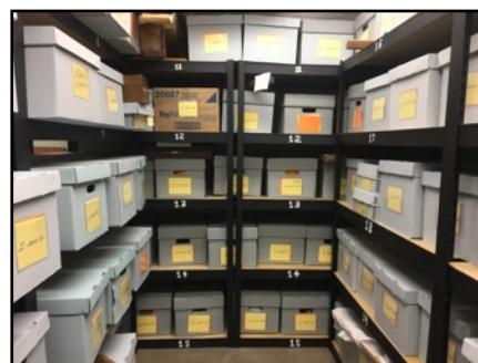
HSL Attic Collections

The $20,650 award will fund Museum Administrator Chessie Monks-Kelly's work on the creation of a long-range Collections Preservation Plan. Based on a 2011 assessment completed with a National Endowment for the Humanities Preservation Assistance Grant, the plan will include recommendations for environmental control, disaster planning, security, housekeeping, collection storage and housing, digital storage, reformatting, and conservation treatment. The project will also update existing policies and set long-term goals for the museum and its collections. Chessie brings her training and expertise in collections management to the project. HSL's grant is one 132 projects selected from 558 applications.