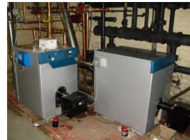
and in with the new!