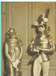
The Misunderstood by Man Ray