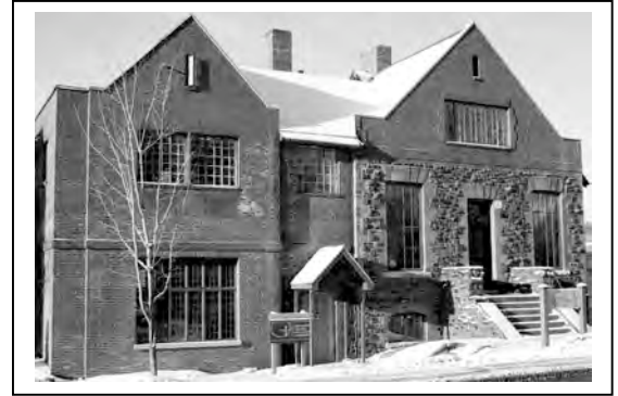
The Saranac Laboratory today

We estimate that we will need an additional $500,000 in order to complete the