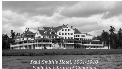
Paul Smith's Hotel, 1901-1910