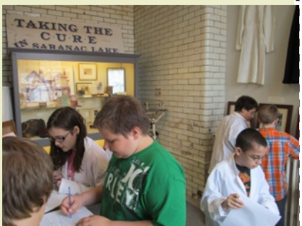
Your membership support makes it possible for us to serve hundreds of area school children with tours and programs each year. As students learn about their history, they develop an interest in the future of our community.

I would like to find out more about helping as a volunteer.