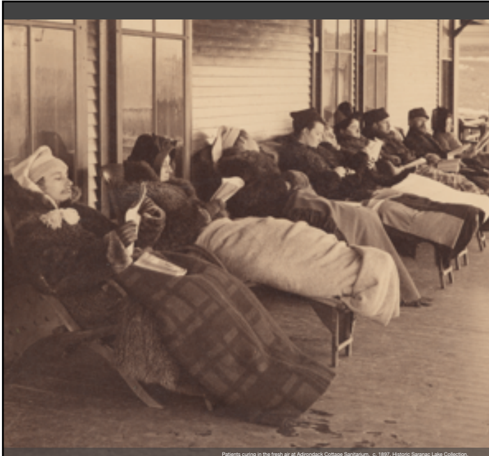
Patients curing in the fresh air at Adirondack Cottage Sanatorium, c. 1897.