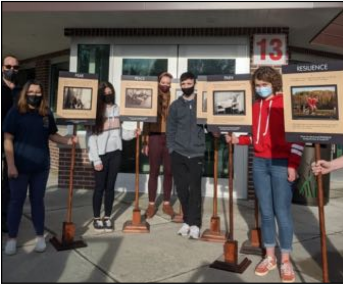
Saranac Lake High School students with Pandemic Perspectives panels