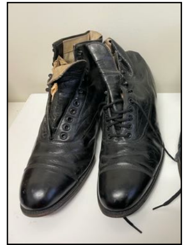
Bartók's shoes, HSL Collection.