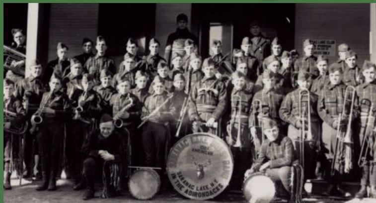
Saranac Lake Boys' Band

Historic Saranac Lake is a not-for-profit 501(c)(3) organization. Dues and other contributions are tax deductible as provided by law.