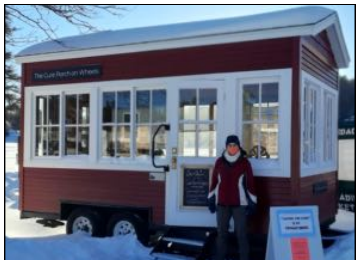
The Cure Porch on Wheels celebrated Winter Carnival at the Ice Palace!

Special thanks to the Stewart's Foundation and the Golub Foundation for their continued support of our educational programs!