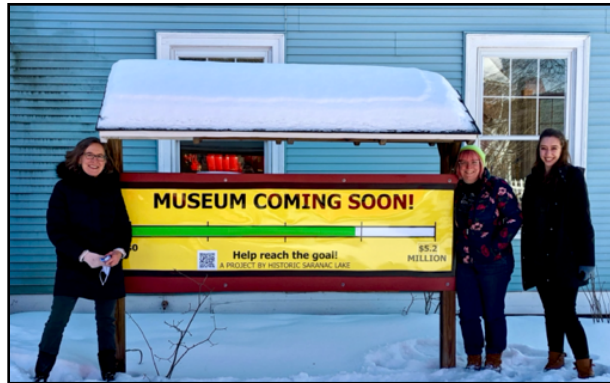
HSL staff pose with the new sign.