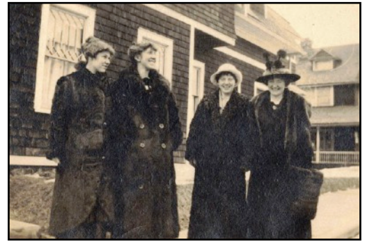
Patients in Saranac Lake, HSL Collection.