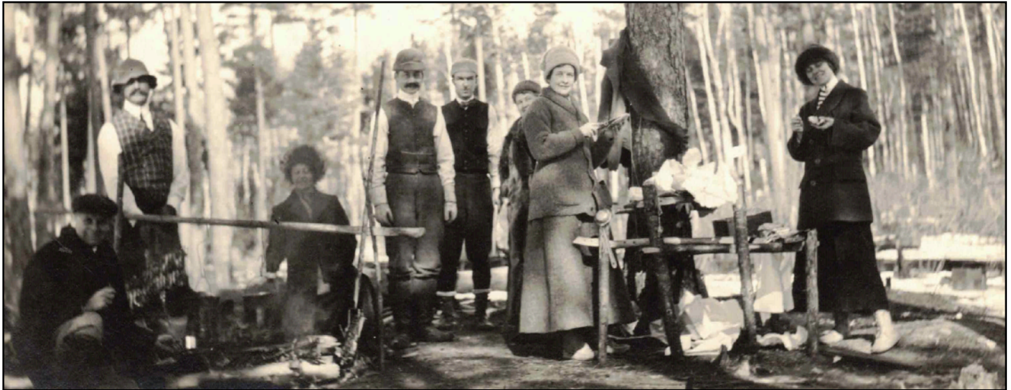
Late winter camp picnic.