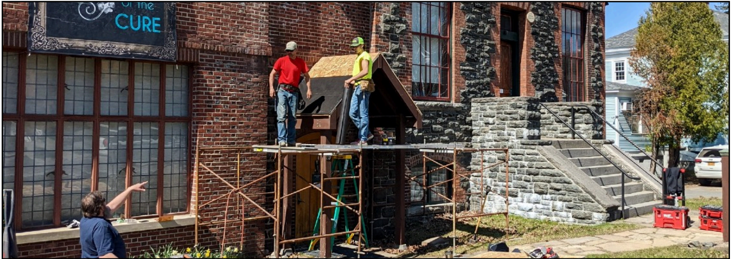
Workers from GS Restoration repaired and reinforced the Saranac Laboratory portico, damaged by ice this winter. The work is supported by generous donations received this fall for emergency museum repairs.