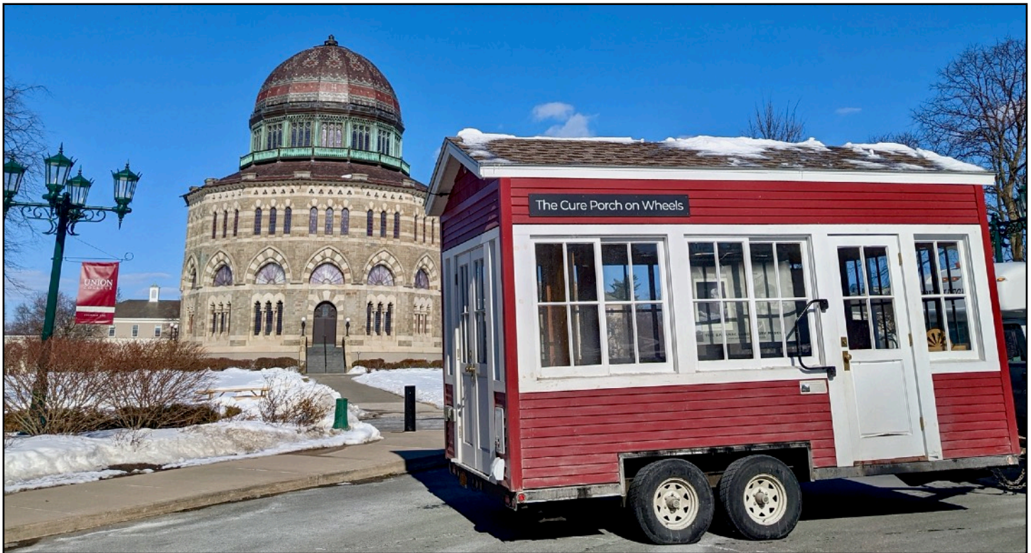
This February, the Cure Porch on Wheels visited historic Union College in Schenectady.