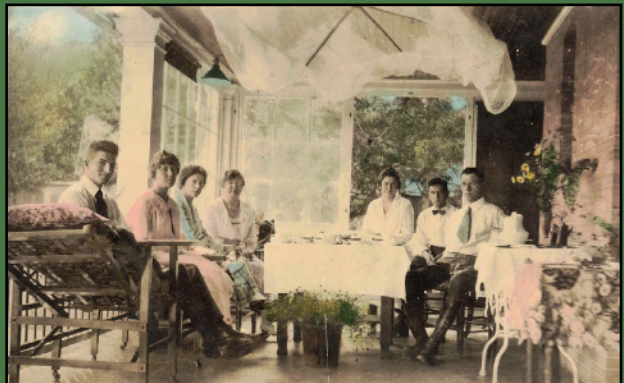
Patients on Porch at Ray Brook

Historic Saranac Lake is a not-for-profit 501(c)(3) organization. Dues and other contributions are tax deductible as provided by law.