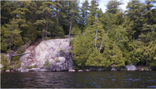
Tom's Rock on Eagle Island

7. Tom's Rock Lean-to on Eagle Island was built in 1922 with permission from the state.