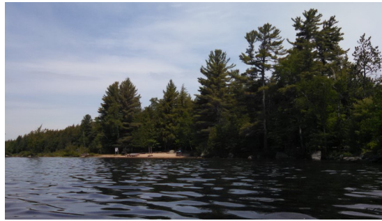
Guggenheim Camp, Photo by R. Cilley

3. Rock Ledge or Guggenheim Camp was built by Richard Limburg in 1898, a governor of the New York Stock Exchange. Edmond Guggenheim purchased the property in 1917. It was bought by Wadham Hall in 1963 and deeded to the Catholic Diocese in 1968 to be run as a camp for teenagers.