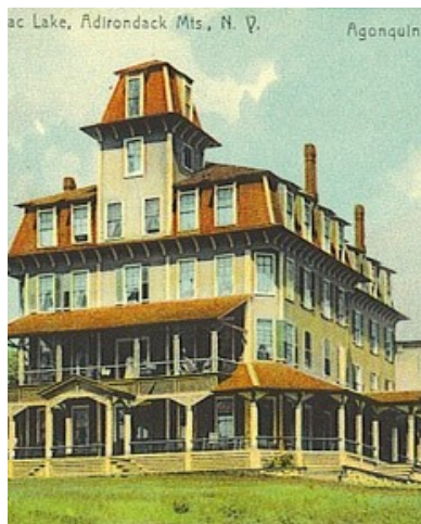
Algonquin Hotel