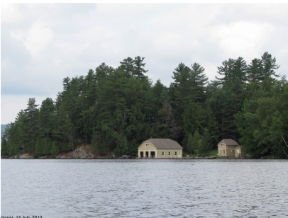
Pinehurst Camp