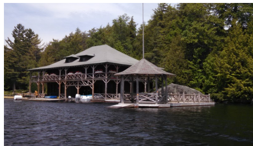
Knollwood Club Boathouse