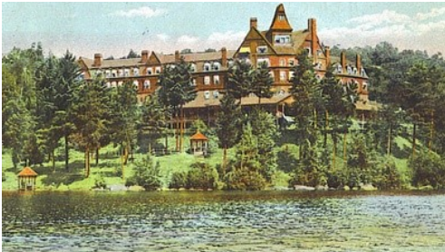
Hotel Ampersand

1. Hotel Ampersand opened in 1888 and quickly became a popular tourist vacation hotel. It could accommodate 300 guests. It included a nine hole golf course, music concerts and dances. The hotel was a popular place for people to boat, fish and swim.