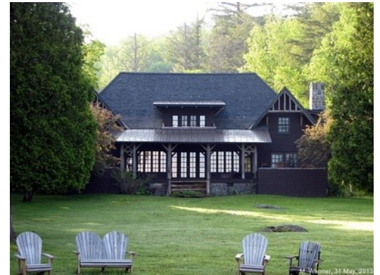
Swain Camp