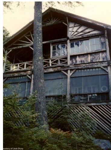
Mark Twain Camp

10. Mark Twain Camp was so named because Samuel Langhorne, his wife and two daughters spent the summer of 1901 at the Kane Camp.