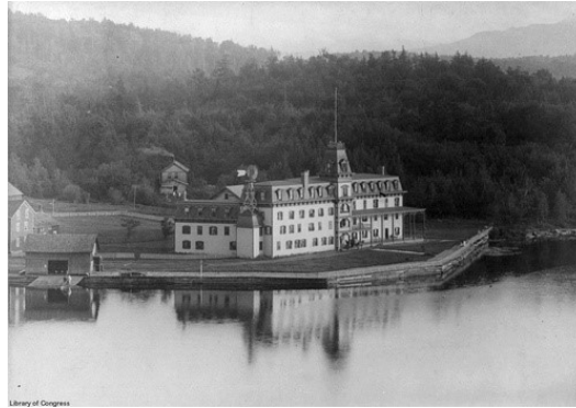
Martin's Hotel