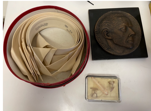
Béla Bartók's Concert Shoes, bow ties, glasses, collars, medal, cufflinks. HSL Collection