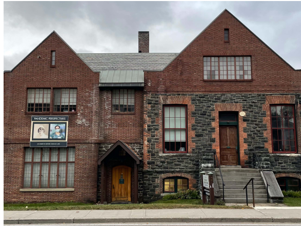
The Saranac Laboratory Museum